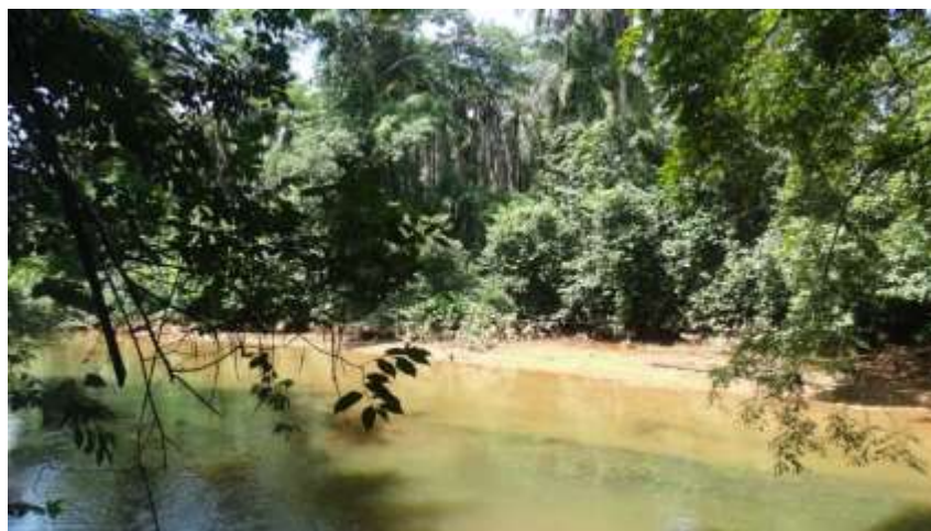
Plate 4.4: The freshwater stream observed at the edge of the project footprint