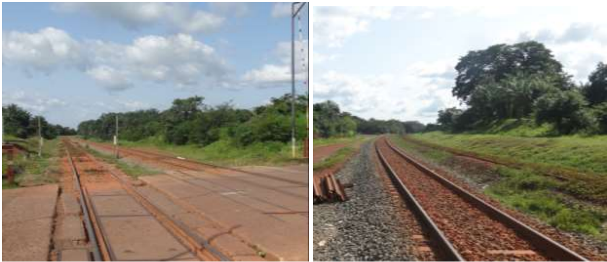
Plate 4.5: Transformed habitat along Railway as observed within the project area

This habitat is characterised by areas cleared of natural vegetation mainly for housing and infrastructure as well as some of the roads and railway lines within the project AoI. The project footprint where the project will be situated is also classified as transformed habitat. The vegetation structure consists of short shrubs and grassland including some non-native crops and weeds. No IUCN Red-listed Data species were recorded within this habitat unit. This habitat is assigned a low sensitivity.