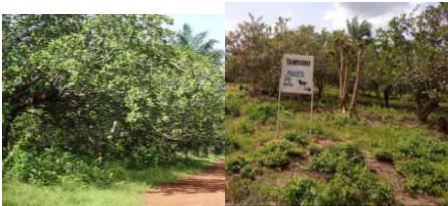
Plate 4.3b: Agricultural plantation (Cashew farm) observed in the area U q w t'Tekge<j h n q q f . " 4 2 4 4