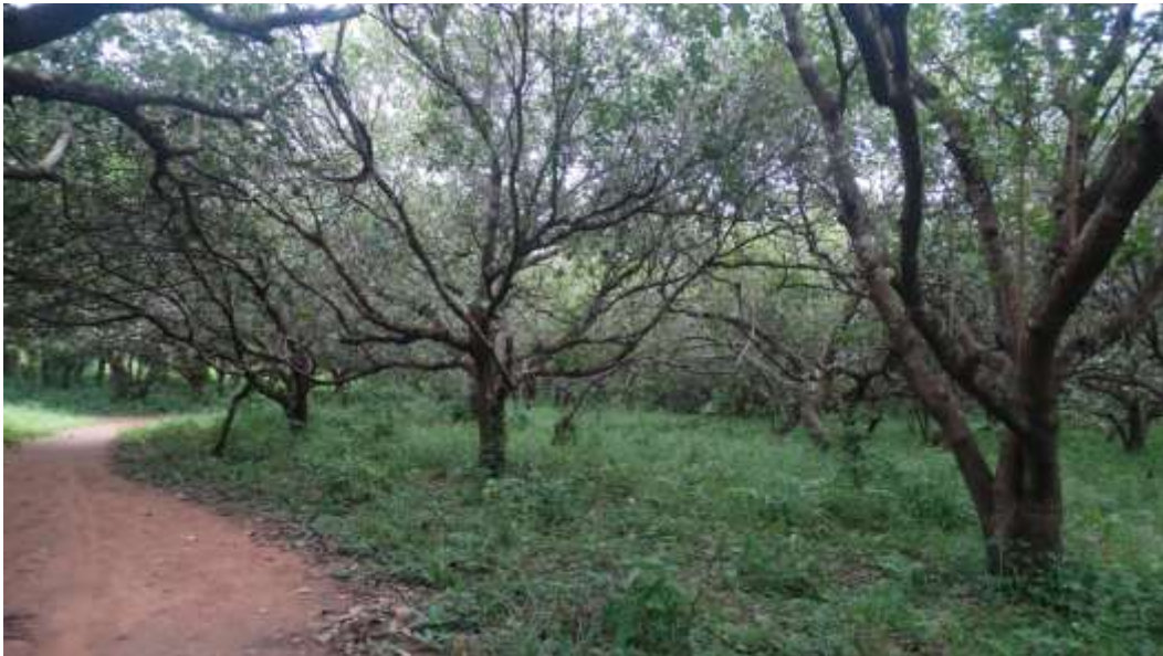
Plate 4.2: Cashew Plantation within the Project AoI