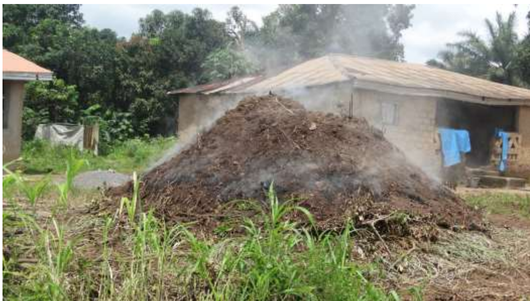
Plate 4.7: Ecological Impacts observed: Wood burning to produce Charcoal