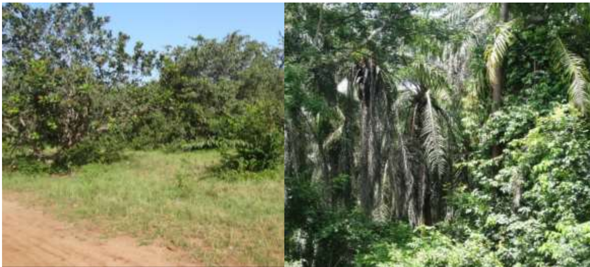
Plate 4.6: Mosaic Natural and Modified Habitats