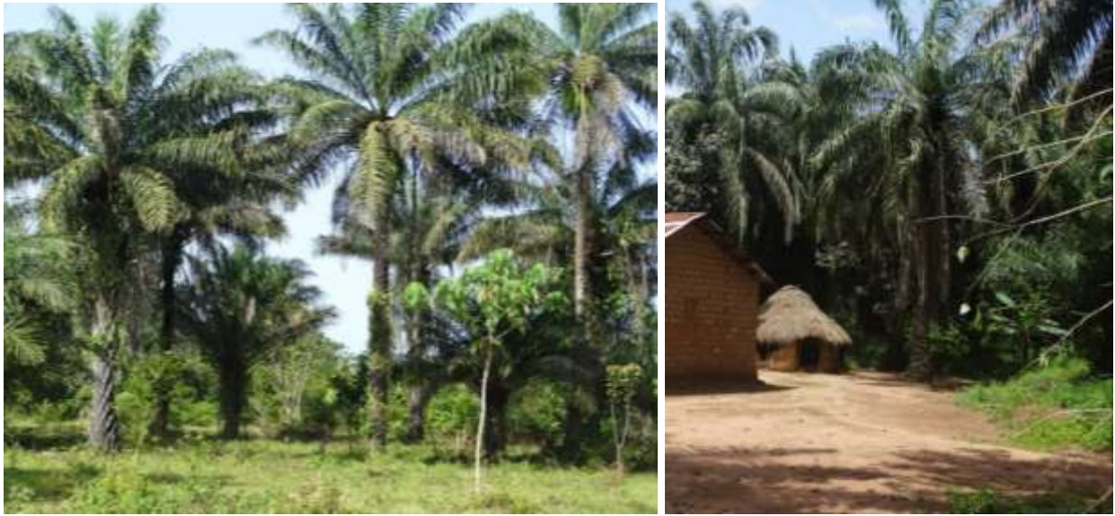
Plate 4.3a: Agricultural plantation (Palm plantation observed) in the area U q w t'Tekge<j h n q q f . " 4 2 4 4