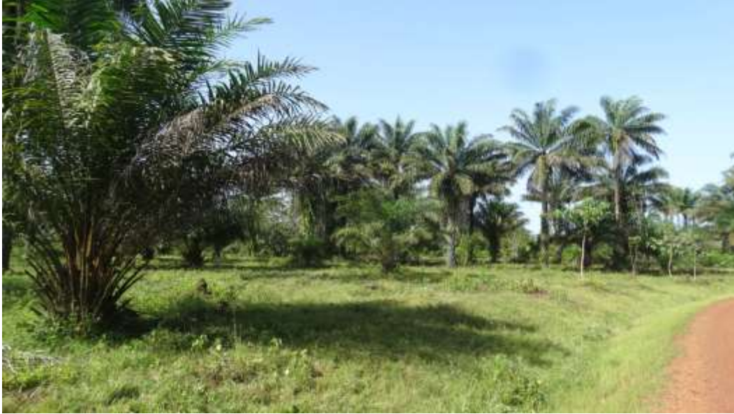
Plate 4.1: Palm plantation within the project AoI