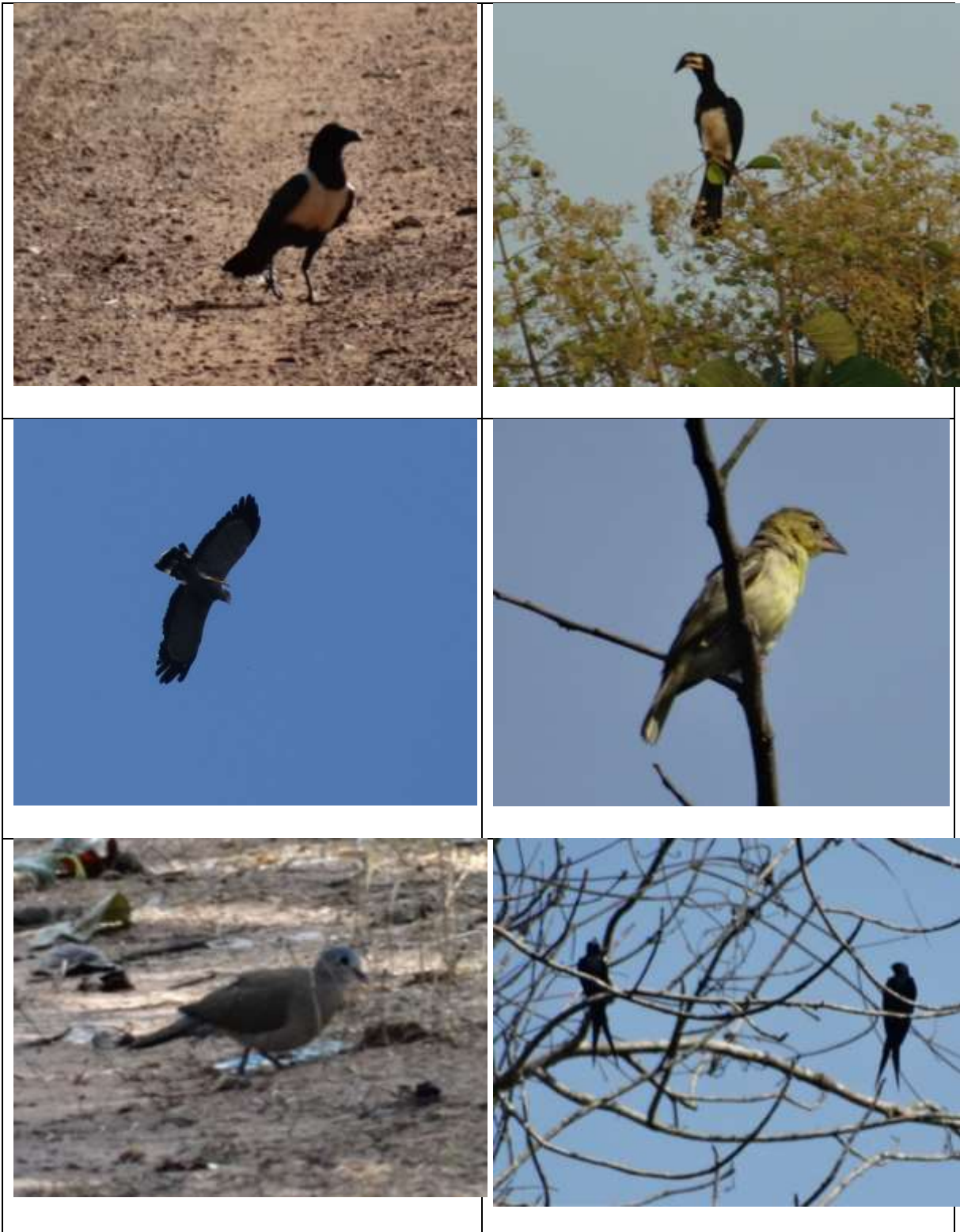
Plate 21: Some of the avifauna recorded in the project area: A) Northern Red-billed Hornbill, B) Senegal Coucal, C) Western Cattle Egret, D) Yellow-billed Shrike, E) Long-tailed Glossy Starling and F) Abyssinian Roller